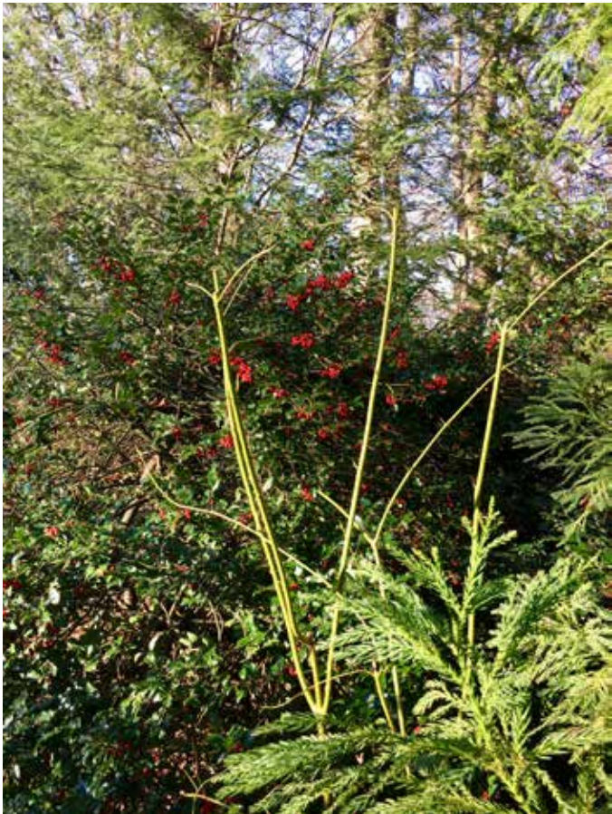
Yellow Twig Dogwood with the female Holly behind; at the right, branches of Cryptomeria.

Our one ornament is a 14" diameter green glass fishing net float. Finally, we installed birdfeeders.