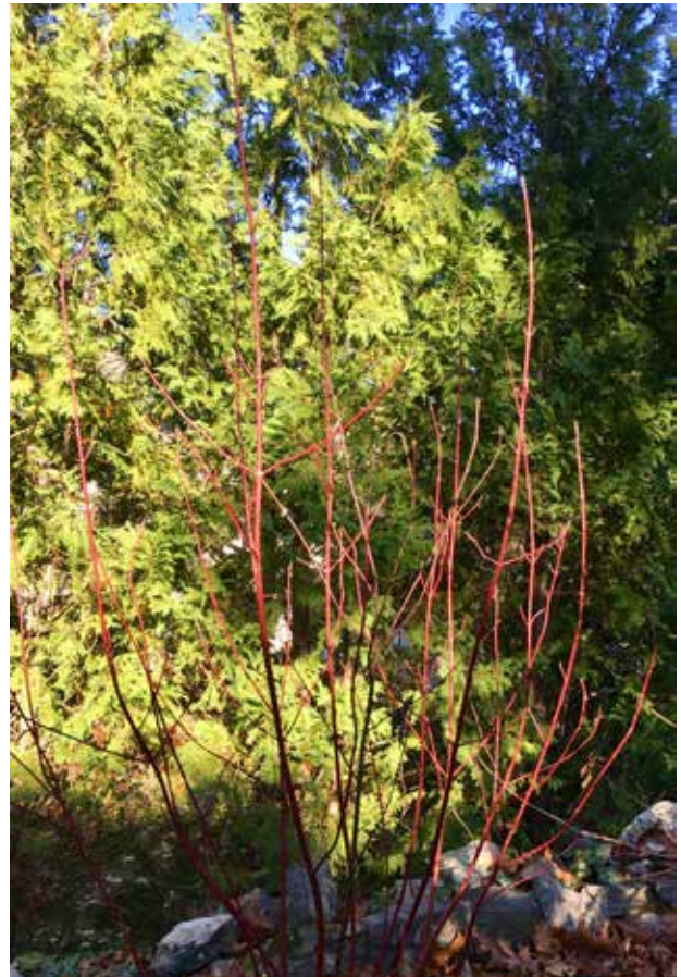
Red Twig Dogwood in front of neighbors' Arborvitae.