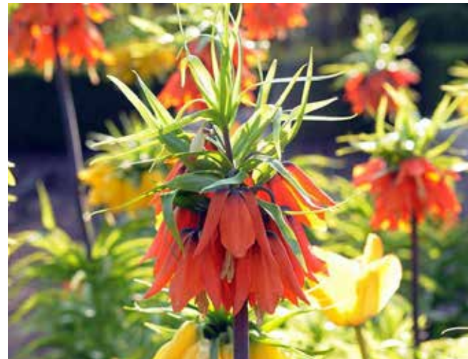
Give your garden the royal treatment with crown imperial (Fritillaria imperialis). Crown imperials have been nicknamed the "stink lily" for their pungent odor. But this smell repels deer and other pests that eat bulbs.

When you have more than you need, consider saving them for LFGC 2024 PLANT SALE. This year, I planted the divisions right into my garden to be dug out next spring for our crew. The divisions seem very happy.