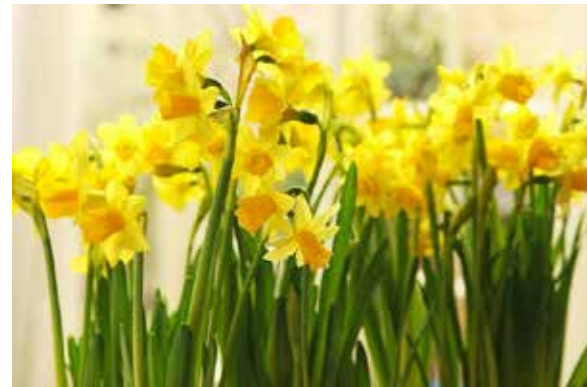
A showstopper when in bloom, 'Jetfire' blooms in early spring.

Plant your bulbs about four to six weeks before your area's expected first hard frost, giving your bulbs enough time to grow roots. After sufficient time in cold temperatures, they'll grow leaves and flowers the following spring.