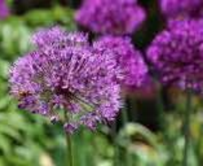
Allium comes in rich colors like white, purple, blue, pink, and yellow and many sizes.

Most bulbs do best in full sun (at least 6 hours a day) and well-drained soil rich in organic matter. The best time to fertilize bulbs is when you are planting them. Mix the fertilizer into the soil before placing the bulb in the hole. A good watering will eliminate air pockets in the soil that could cause your bulbs to dry out and encourage them to send out roots.